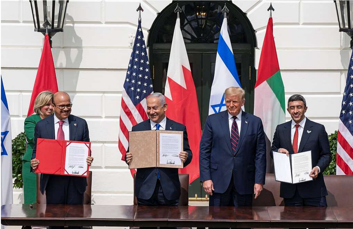
President Donald J. Trump, Minister of Foreign Affairs of Bahrain Dr. Abdullatif bin Rashid Al-Zayani, Israeli Prime Minister Benjamin Netanyahu and Minister of Foreign Affairs for the United Arab Emirates Abdullah bin Zayed Al Nahyan signs the Abraham Accords Tuesday, Sept. 15, 2020, on the South Lawn of the White House.